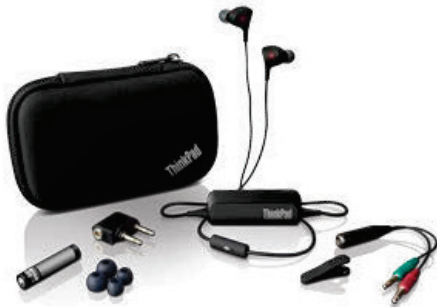
ThinkPad® Noise-Cancelling Earbuds