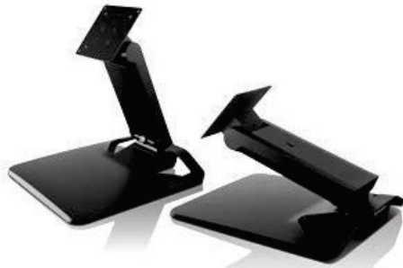
Lenovo® Universal All-in-One Stand