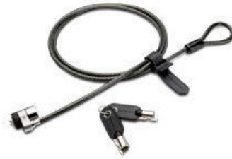
Kensington® MicroSaver Security Cable Lock by Lenovo®