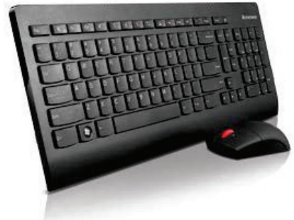
Lenovo® Ultraslim Wireless Keyboard and Mouse Combo